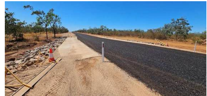
Normanton Burketown Road - Concrete/rock Protection Works (TIDS Funded).

Poingdestre Creek - Council has completed the widening of Poingdestre Creek from existing 4.5m concrete floodway to a 9m wide under TIDs funding. The existing floodway will remain in place. Bitumen seal has reached the Normanton side of this floodway.