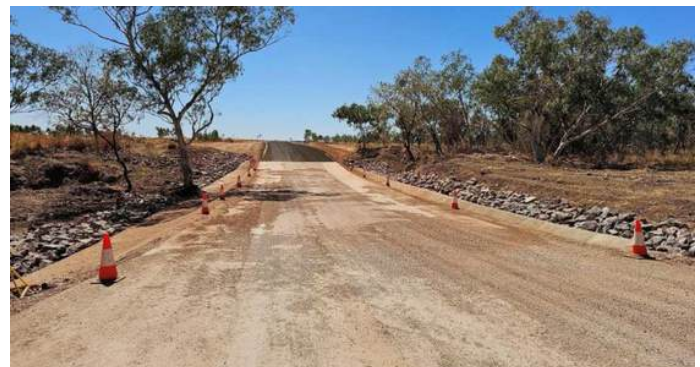
Normanton Burketown Road - Widening of Poingdestre Creek.