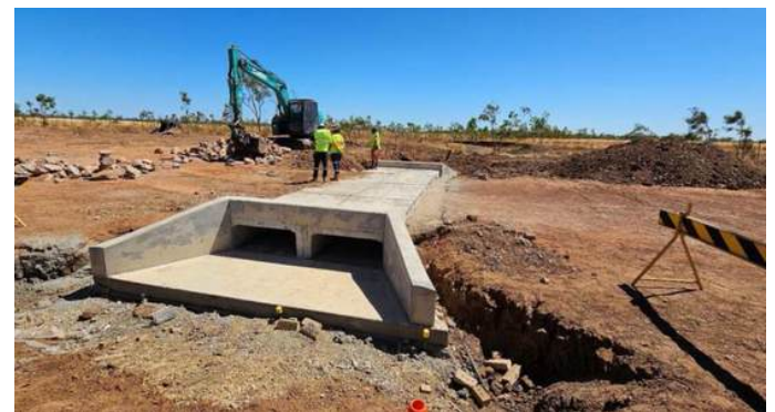
Normanton Burketown Road - New culvert (near Poingdestre Ck) (TIDS).

Poingdestre Creek - Council has completed the widening of Poingdestre Creek from existing 4.5m concrete floodway to a 9m wide under TIDs funding. The existing floodway will remain in place. Bitumen seal has reached the Normanton side of this floodway.