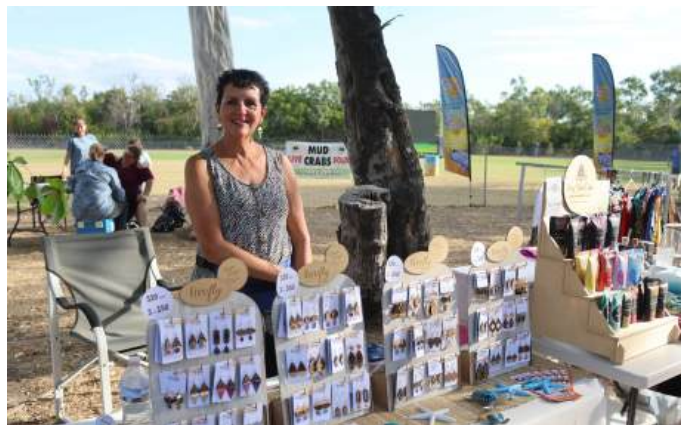
Market stalls were held prior to the event.