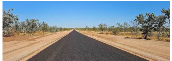
Normanton Burketown Road - Bitumen Works (Betterment Funded).