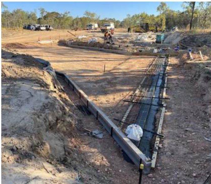
Base slab prep works.

The works will include the installation of four (4) 2700 x 1200 box culverts and the construction of concrete batter protection. TMR has completed Cultural Heritage clearance with Traditional Owners. Work has started with clearing works completed and culvert foundations being prepared. Culverts for this job have been brought to the Clark Creek Pit site. Tight environmental controls are in place for this project.