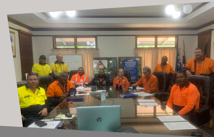
Rosalie Works Depo Karumba

Key Leaders from our outdoor team took place in Workplace Health and Safety Development Training to advance their knowledge and skills. This was the first virtual training session conducted since the outbreak of COVID-19. Our HR manager is busy getting training plans back in place as restrictions continue to ease.