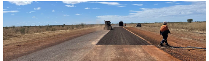
Burketown Road patch repairs.