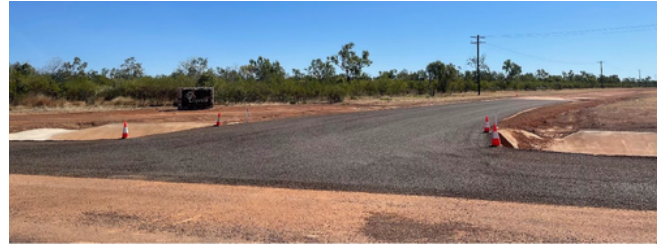
Lilyvale entrance sealed.