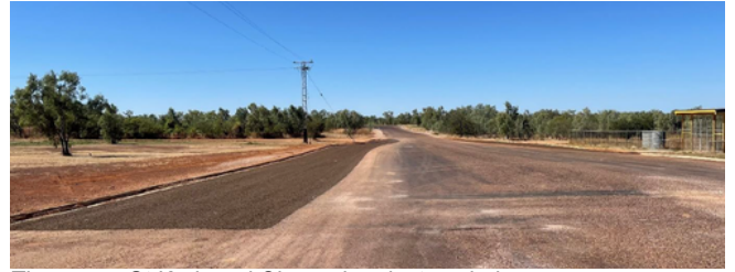
Thompson St Kerb and Channel project sealed.