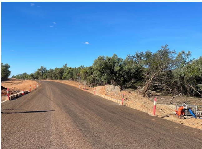
Armstrong Creek sealed.