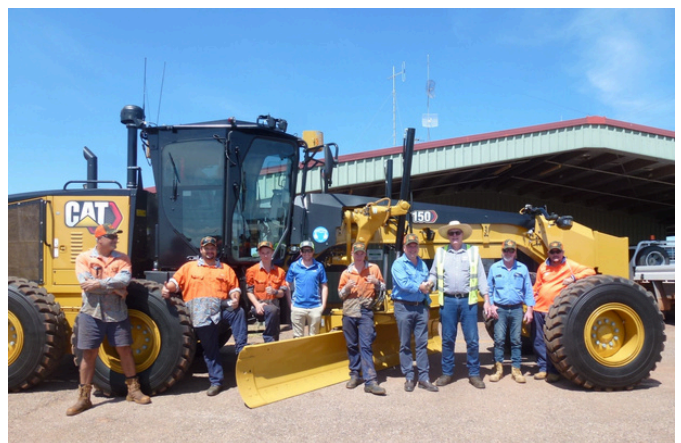
A new Grader arrived last week to assist with road works