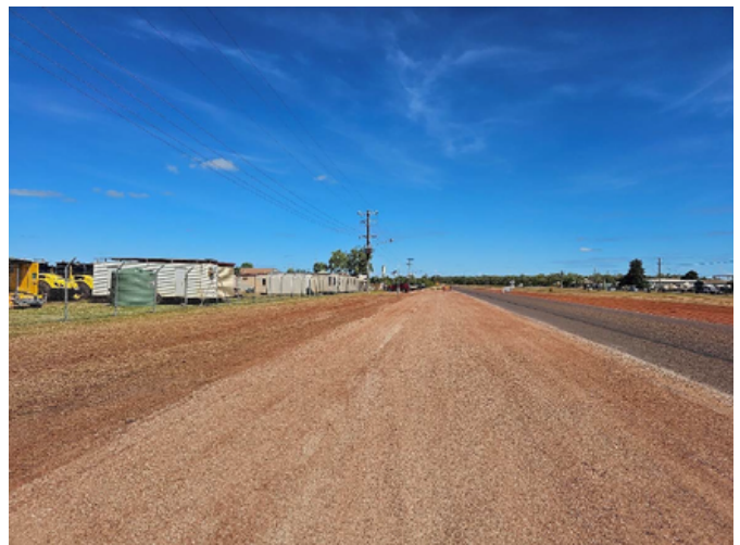
Completed shoulder edge repairs on the Old Croydon Road