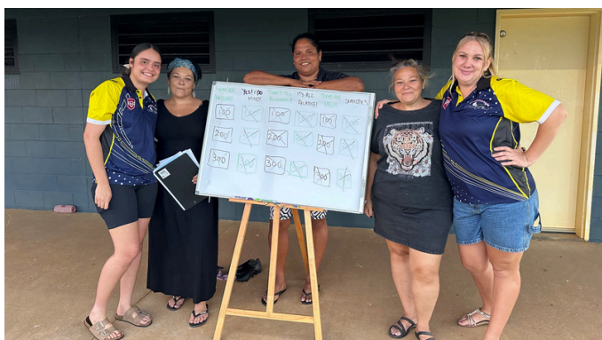
ADA Support service team who addressed the young ladies at Talk is tough Touch event.